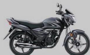
GENY GREY METALLIC