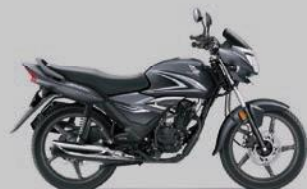
MATTE AXIS GREY